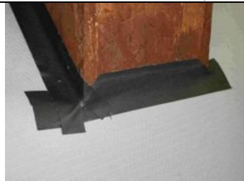
10.10 stick the side membrane overlaps on the chimney