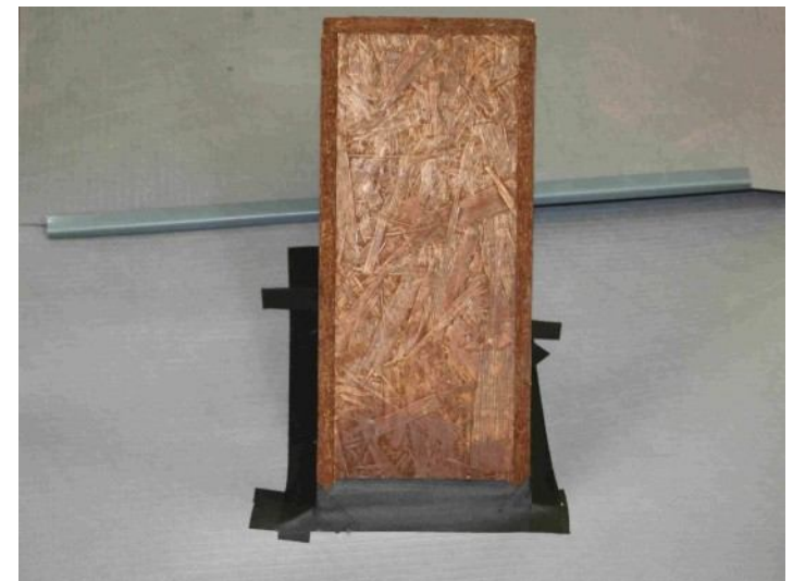
10.14 breathable membrane – CHIMNEY – VENTILATION SCHAFT