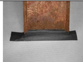
10.9 sticking of bottom membrane overlap