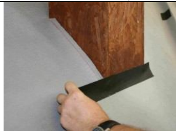
10.7 stick the bottom membrane overlap on the chimney