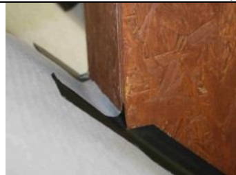
10.11 diagonal cut of the tape at the upper corner of the chimney