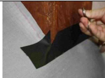
10.8 diagonal cut of the tape at the bottom corner of the chimney