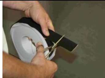
10.5 tape JUTADACH SP SUPER