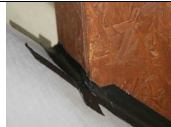
10.12 sticking of upper membrane overlap