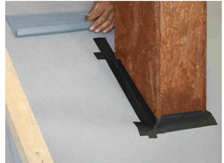
10.13 drainage ditch above the chimney or ventilation schaft