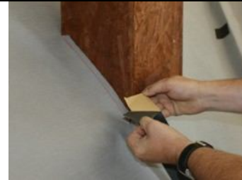
10.6 remove the tapes paper cover